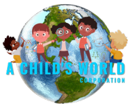
A Child's World

DCSS partners with ten AV service providers.