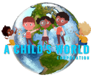
A Child's World

DCSS partners with seven AV service providers.